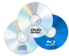
CD / DVD / Blu-Ray CD / DVD / Blu-Ray