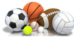
qiú 球 ball